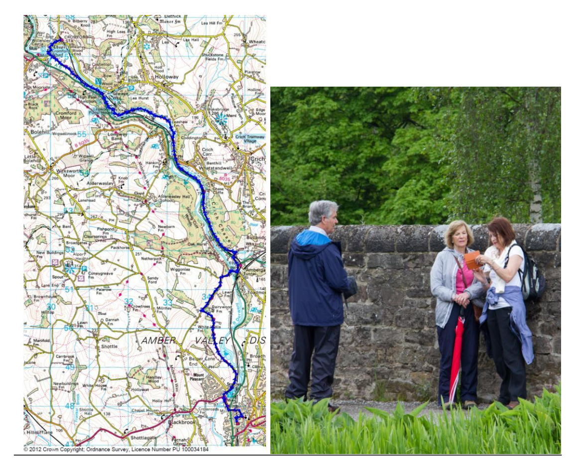
Figure 1: Walking Route